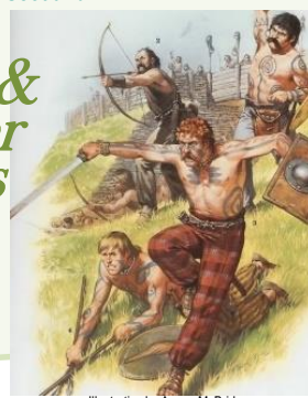
Illustration by Angus McBride

R1b-L513 and Subclades Project www.familytreedna.com/groups/R-L513 All are invited who are L513+ confirmed or confirmed positive for a descendant SNP