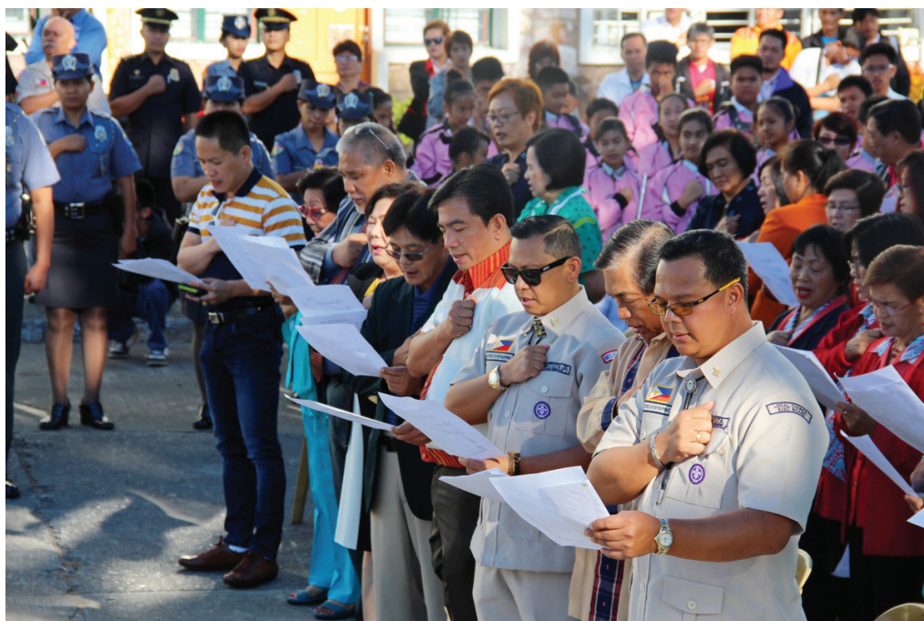
"RESPONSIBLE RICE CONSUMPTION" – City Officials spearheaded by Congressman Nicasio Alip-ing, Jr., Mayor Mauricio Domogan and members of the Scouting Council headed by its National Executive Chairman Reinaldo 'Peter Rey' Bautista, Jr. leads the recitation of the Rice Pledge "Panatang Makapalay" during Mondays Flag Raising ceremony in support of the rice consumer's commitment to reduce rice wastage in line with the celebration of Rice Awareness Month every November.