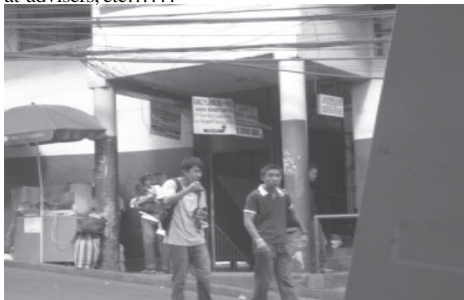
Entrance to Lopez Bldg. Along Chugum St. corner Kayang St. for easy betting. Come one come all, hindi na kailangan pang lumayo!

At para naman sa bagong organisa na volunteer group against criminality, baka naman hindi ninyo alam na ilegal ang sugal na Jueteng, siguro ay tanungin ninyo ang inyong mga pinuno at advisers, etc...???