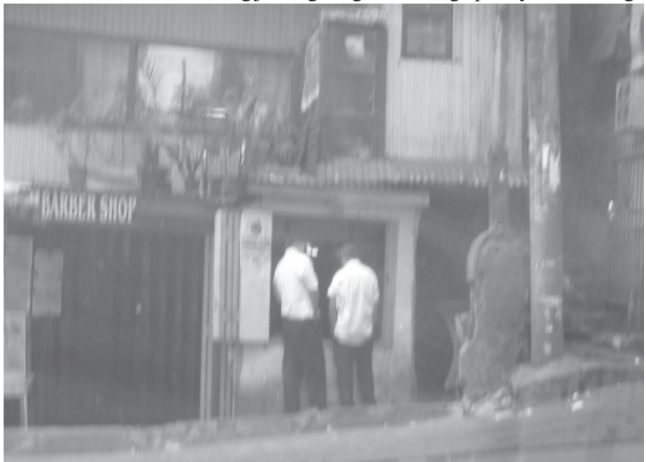
Istasyon ng Jueteng sa tabi ng Center Mall : Makikita sa larawan ang isa pang Jueteng betting station na matatagpuan sa Gomez Bldg., Dagohoy St, katabi lamang ng Center Mall. O, ano pa ang inaantay ninyo TAYAAN NA at kung nalalayuan kayo sa Kayang St., maaring sa Dagohoy St. na lang kayo magpunta.