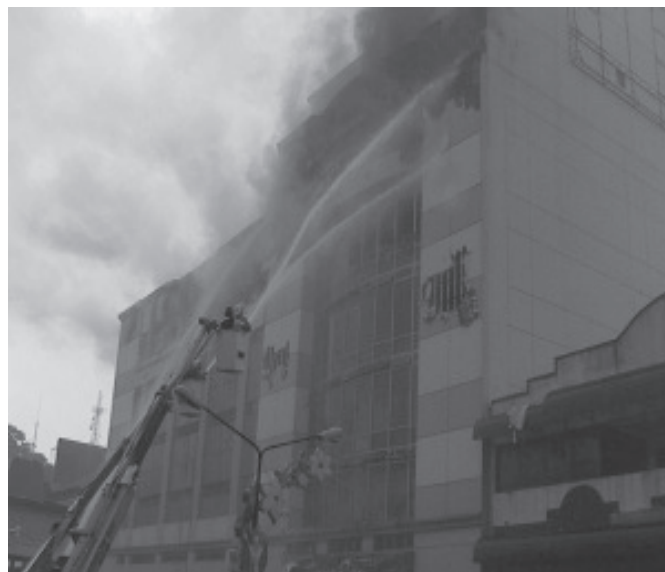
Tiongsan Harrisson on fire.

“So whether duty-free at P31 per kilo, or P46 per kilo to include the 50 percent duty, rice will be expensive. There can