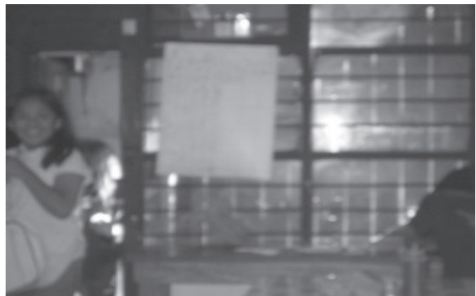
Napakadaling tumaya, may mga guides pa sa mga nakaraang numerong labas. O ano pa inaantay ninyo, halina na, tara na at magsi-tayaan na tayo!!!