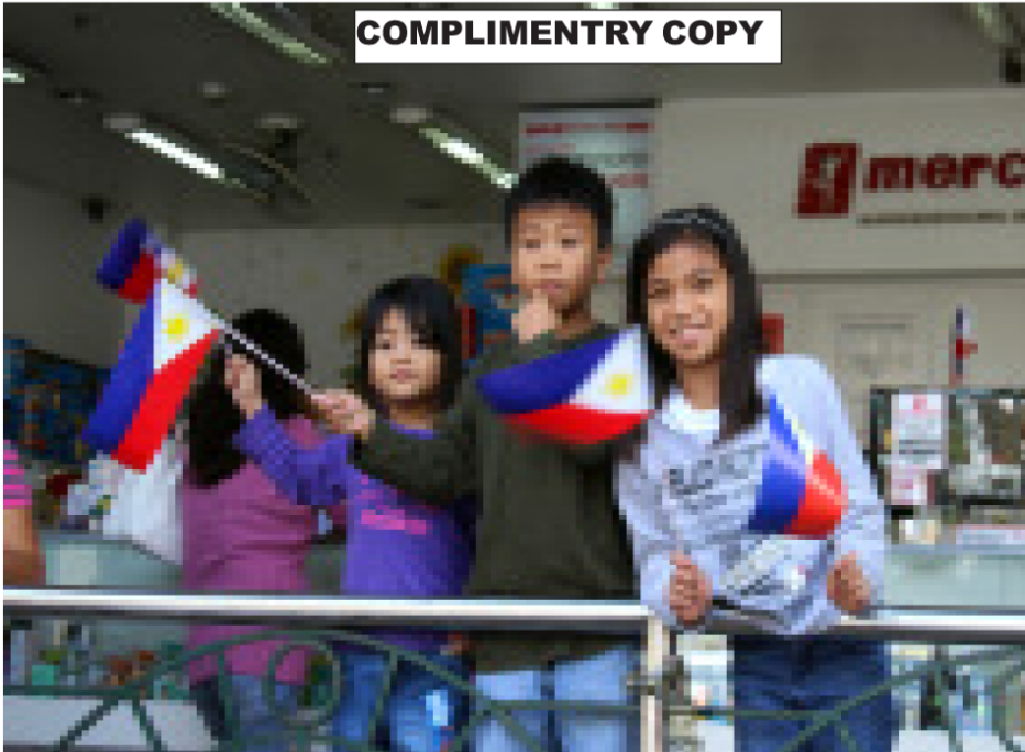
Baguio's children wave the Philippine Flag as parade participants march down Session Road during the celebration of Philippine Independence Day June 12.

L A TRINIDAD, Benguet - Students who will graduate under the K to 12 can easily obtain employment or they can put up their own business because they will acquire technical and vocational skills, said an official of the Department of Education (DepEd) Cordillera.