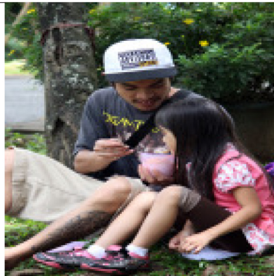
FATHER'S DAY - A father shows his love and care for his child during their bonding moment at the city's premier park.