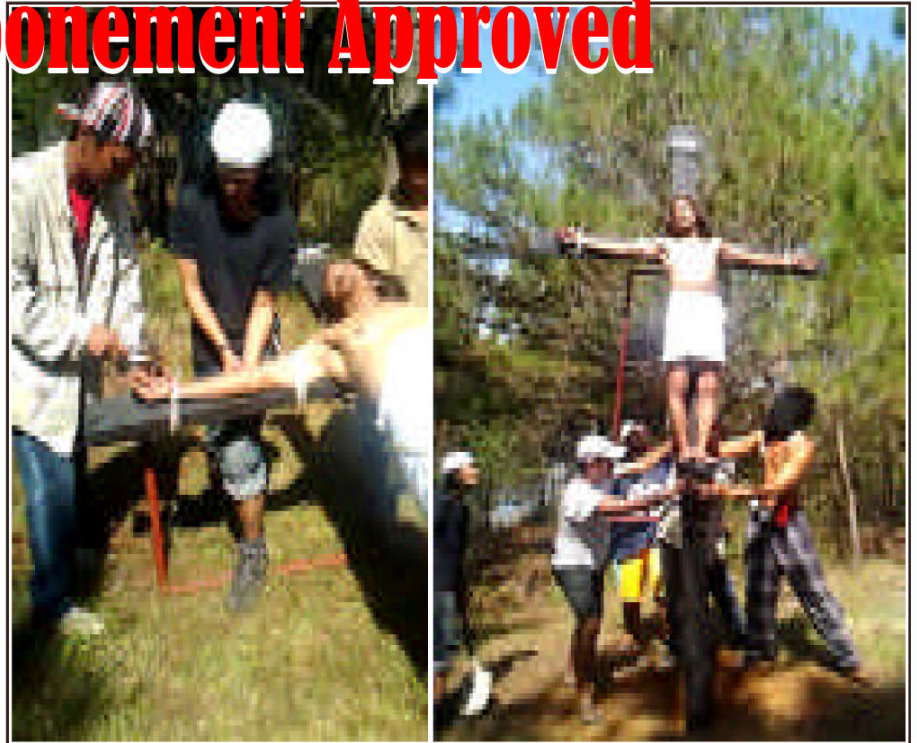
This holy week has seen all sorts of Catholic religious rituals, one of which was the re-enactment on the crucifixion of Christ Jesus which was held last Good Friday (April 3) for the first time in the Cordilleras at the Santuario Dela Sagrada Catolica at Ambuclao Road, Sitio Marooc, Itogon, Benguet.