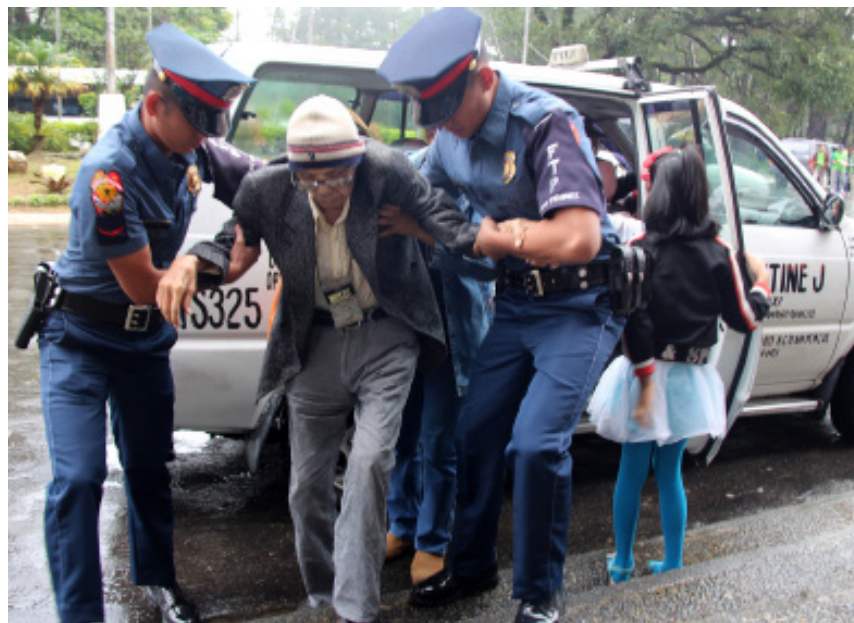
A HELPING HAND: Personnel from the Baguio's Finest extend their helping hand to a Baguio centenarian alighting from a taxi cab.