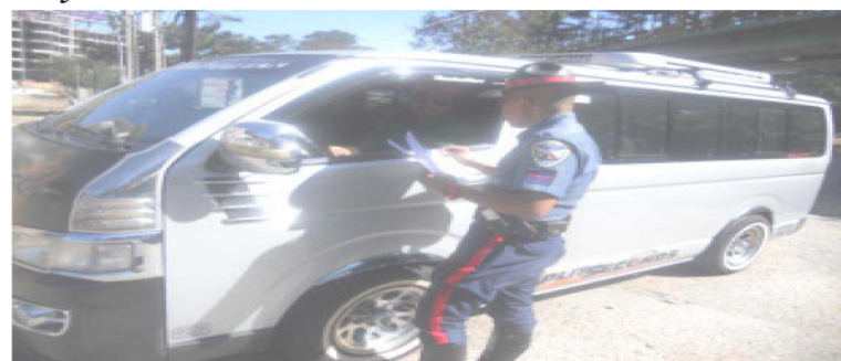
Photo shows RCOR personnel distributing Road safety and Anti-Carnapping leaflets to motorists for safety travel and avoidance of any criminal incident.