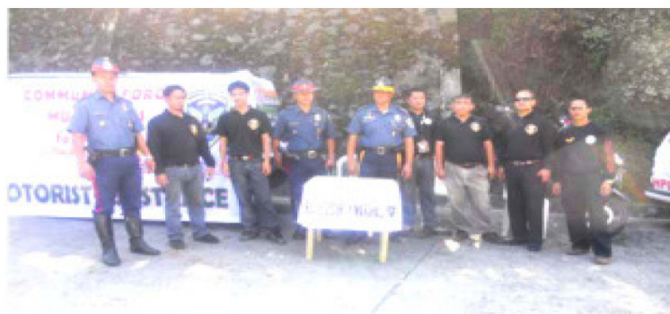
Photo shows RCOR personnel together with members of the Force Multipliers during Simultaneous Launching of HPG OPLAN SUMVAC 2012 in Camp 7, Kennon Road, Baguio City.