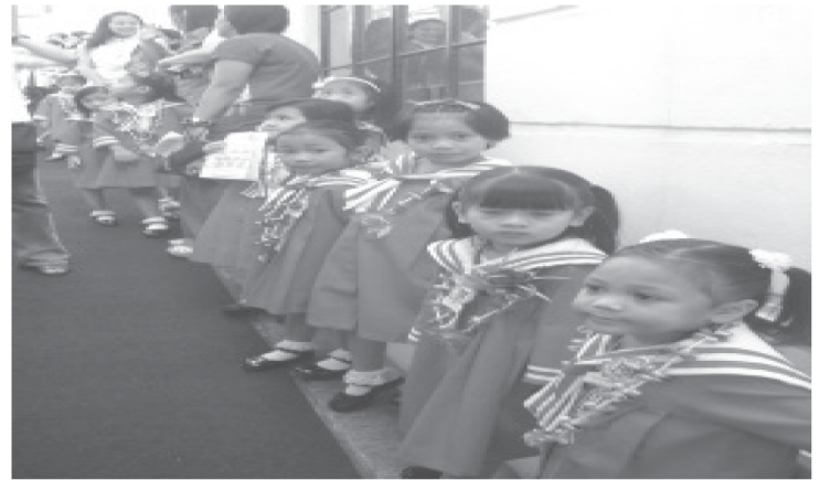
MARCHING TO HIGHER LEVEL - Kindergarden pupils line-up during graduation exercises at City Hall Multi-Purpose Center as proud parents accompany them.