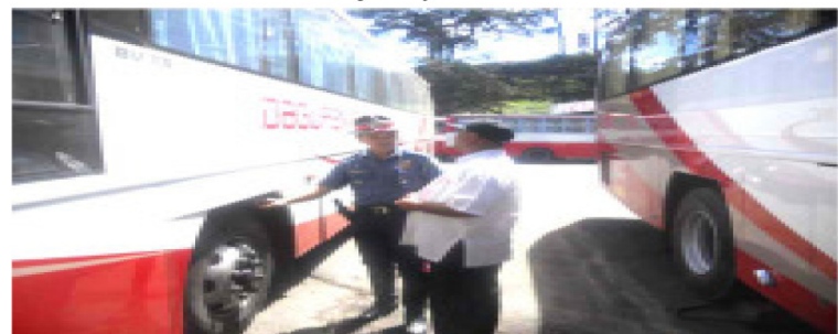
Photo shows RCOR personnel conducting bus inspection for Battery-Lights-Oil-Water-Break-Air-Gas (B.L.O.W.B.A.G) as well as their driver's fitness and readiness for purposes of assuring passengers