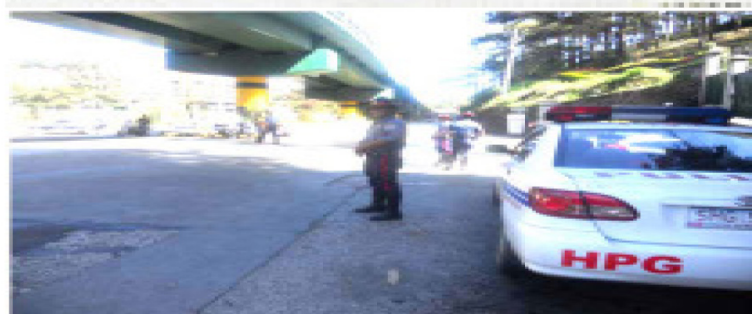
Photo shows RCOR personnel rendering Police Visibility and Motorists Assistance along BGH Rotunda, Baguio City