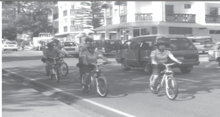
BIKE PATROL - Tourist oriented cops patrol Burnham Park perimeters on bicycles donated by the Police Savings and Loan Association.