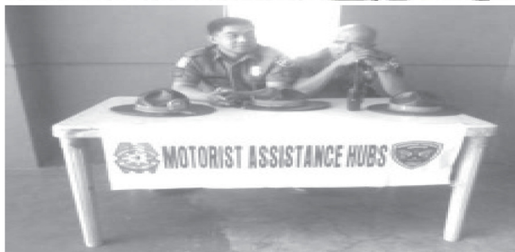
Photo shows RCOR personnel rendering Police Visibility and Assistance with the established "Public Assistance Hub" in Victory Bus Liner Terminal, DPS Compound, Baguio City.