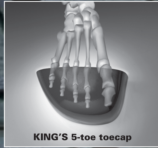
KING'S 5-toe toecap