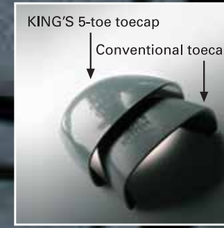
KING'S 5-toe toecap Conventional toecap

KING'S spacious 5-toe toecap provides maximum comfort for your toes