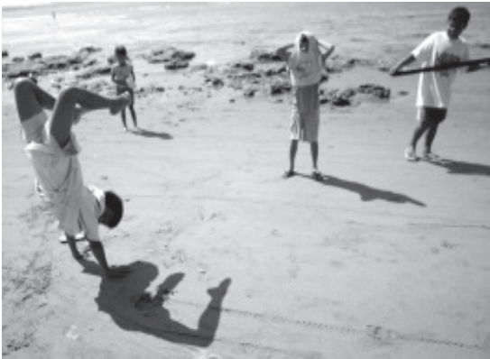
San Juan, La Union -- Budding acrobat! "A young child of a fisherfolk family living beside the sand beaches in this surfing town in the North does a summersault on the soft sand to the frenzy of her playmates." "Children here are content with the simple toys and the perfect environment for them vis-a-vis the high-tech world in urban areas where children's play is largely on the computers.