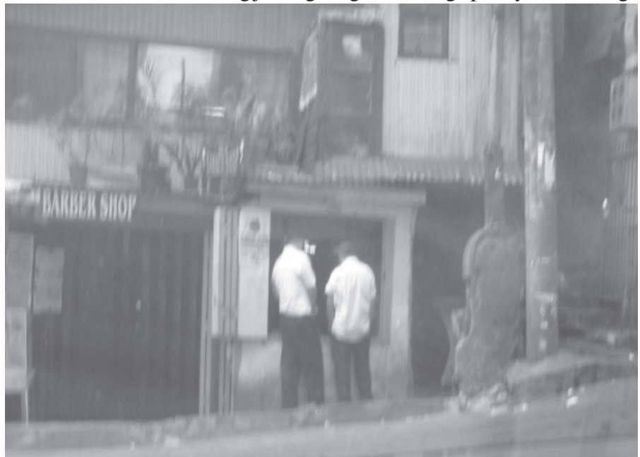
Istasyon ng Jueteng sa tabi ng Center Mall : Makikita sa larawan ang isa pang Jueteng betting station na matatagpuan sa Gomez Bldg., Dagohoy St, katabi lamang ng Center Mall. O, ano pa ang inaantay ninyo TAYAAN NA at kung nalalayuan kayo sa Kayang St., maaring sa Dagohoy St. na lang kayo magpunta.