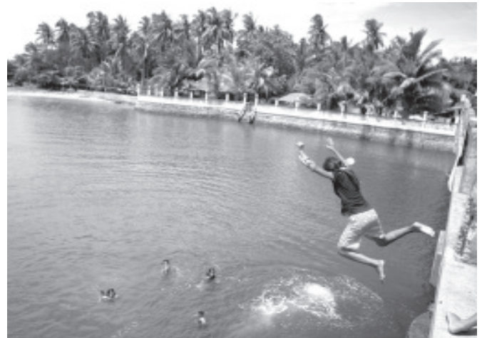
Bolinao, Pangasinan --Summer fun! Young, energetic and adventurous kids, even girls in Bolinao jump off a 20 foot bridge to an estuarine off the coast of the South China Sea for a dip from the summer heat. -- Artemio A. Dumlaog.