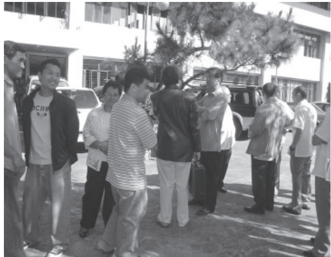
THE BOMB THAT WENT PFFFT. Court employees and bystanders patiently wait outside the Justice Hall building (pix 993) after a prankster, who probably had a case lined up for the day, decided to extend court respite by calling three offices about an “imaginary bomb,” which the BCPO’s explosives and ordnance disposal unit (pix 116) successfully disarmed “imaginarily” after a thorough search of the building. **By Bong Cayabyab