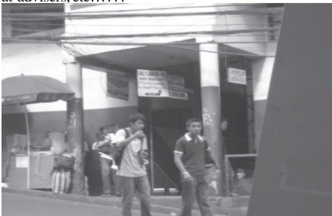
Entrance to Lopez Bldg. Along Chugum St. corner Kayang St. for easy betting. Come one come all, hindi na kailangan pang lumayo!

At para naman sa bagong organisa na volunteer group against criminality, baka naman hindi ninyo alam na ilegal ang sugal na Jueteng, siguro ay tanungin ninyo ang inyong mga pinuno at advisers, etc...???