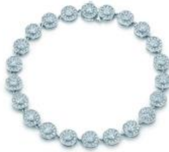
Tiffany Circlet bracelet of diamonds in platinum. $17,000.00