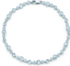
Tiffany Cobblestone Diamond Bracelet in platinum with diamonds. $11,000.00