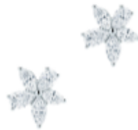
Tiffany Victoria® mixed cluster earrings in platinum with diamonds, large. $16,500.00