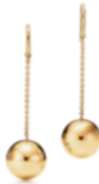
(One) Tiffany HardWear ball 14MM hook earrings in 18k gold. $1,250.00