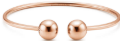
Tiffany HardWear ball wire bracelet in 18k rose gold. $1,700.00