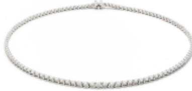
Tiffany Victoria® graduated line necklace in platinum with diamonds. $58,000.00