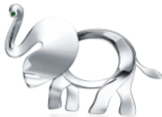
Tiffany Save the Wild elephant brooch in silver with a tsavorite, large. $500.00