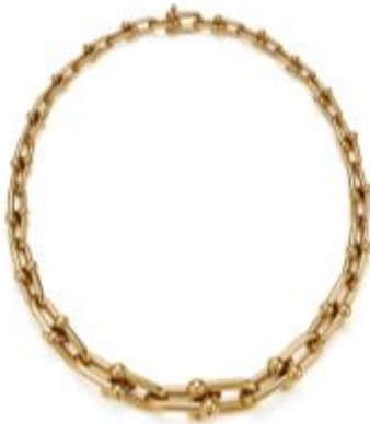
Tiffany HardWear graduated link necklace in 18k gold. $9,500.00