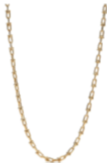
Tiffany HardWear necklace in 18k gold. $5,500.00