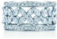
Tiffany Victoria® band ring in platinum with diamonds. $16,500.00