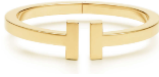
Tiffany T square bracelet in 18k gold, small. $5,200.00