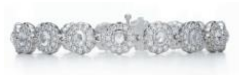
Tiffany Cobblestone bracelet in platinum with diamonds. $25,000.00