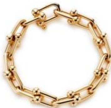
Tiffany HardWear link bracelet. $6,000.00