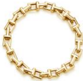
Tiffany T chain bracelet in 18k gold, medium. $5,600.00