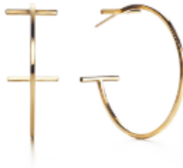
Tiffany T wire hoop earrings in 18k gold, large. $1,650.00