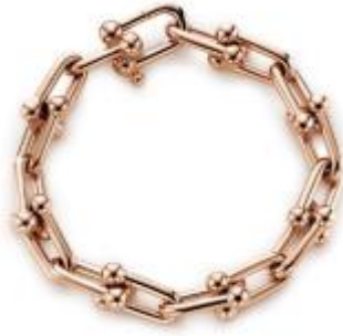
Tiffany HardWear link bracelet in 18k rose gold, medium. $6,000.00