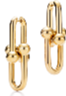
Tiffany HardWear link earrings in 18k gold. $4,000.00