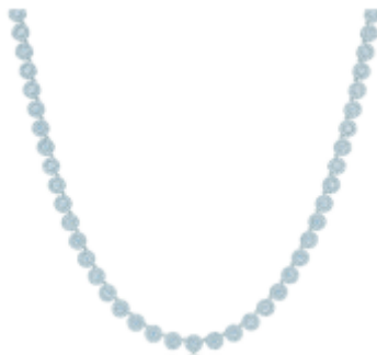
Tiffany Circlet necklace with diamonds in platinum, mini. $43,000.00