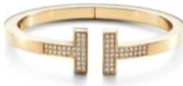
Tiffany T square bracelet in 18k gold with pavé diamonds, small. $10,500.00