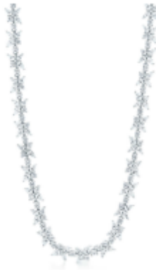
Tiffany Victoria® mixed cluster necklace in platinum with diamonds. $100,000.00