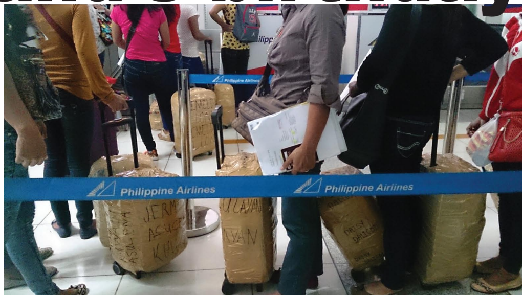
FEAR OF TANIM BALA. OFWs bound for Dubai and Kuwait had to totally wrap their luggages with packaging tape for fear of becoming a victim of tanim bala perpetrators at the NAIA Terminal 2 (exclusive for our flag carrier Philippine Airlines). With the incoming Duterte administration, will this pesky menace finally see its end?