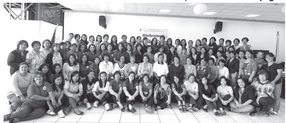
SUBSIDY INCREASE FOR DAY CARE WORKERS - Mayor Mauricio Domogan thanks the continued dedicated service of the city's day care workers who despite receiving only a minimal of P4,000 a monthly honorarium during the Capability Building of Day Care Workers and group picture taking. Domogan promised to increase the subsidy to P6,000 a month which is now pending approval at the City Council.