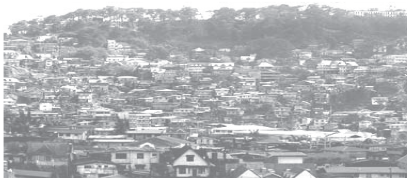
HAZARD CAPITAL. One of the populated slopes of Baguio City, which geologists say is landslide prone.

MANILA, Dec. 30 (PNA) — Resiliency of the Philippines banking system was seen since the start of 2008 even when the financial system of the world's biggest economy — the United States — is on the brink of collapse.