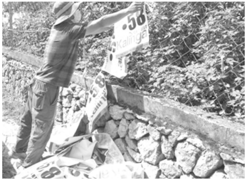
A volunteer removes campaign paraphernalia just after the May 9 elections.

Most significant of its forest protection effort is the conduct of research on the bark beetle damaging the pine trees. "From 2014 to 2015, the consultancy services of forest pathologists from the Benguet