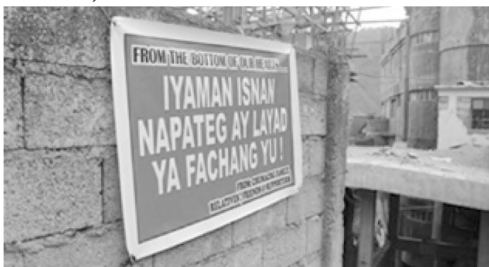
This is just one of the many posters or streamers now being hanged in conspicuous corners, on vehicles and along the roads and pathways in the capital-town of Bontoc, Mountain Province where winners and losers in May 9 elections acknowledge the support and votes of the electorate.

Copies of the approved resolution will be forwarded to the PNP regional and national headquarters and the BCPO for their information, guidance and ready reference./By Dexter A. See