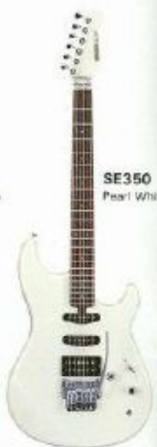
SE350 Pearl White