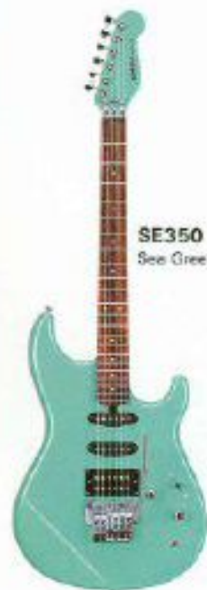
SE350 Sea Green