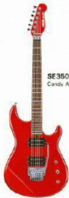
SE350H Candy Apple Red