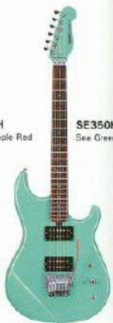
SE350H Sea Green