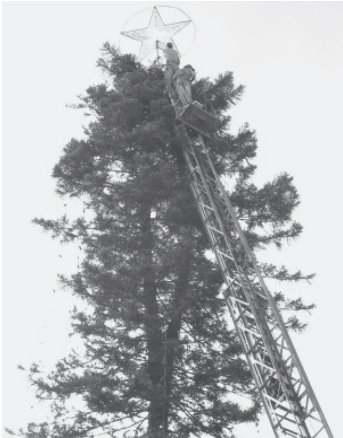
A STAR IS BORN! Workers place a star on top of Baguio's century old and natural Christmas Tree -- a Cypress Tree -- at the foot of Session Road in preparation for the Yuletide Season. The Christmas breeze begins to be felt around here as temperature begins to dip to a low of 14 now sending cold shivers bringing the Christmas season in. -Artemio A. Dumlaog

BAGUIOCITY – "As far as I'm concerned, the Korean proposal over Dominican Hill is dead."