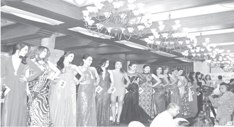
BEAUTIFUL LADIES - Miss Baguio 2015 hopefuls are formally presented to the members of the Media during the Press Conference and Glamour Night at the Fortune Seafood Restaurant last August 19.