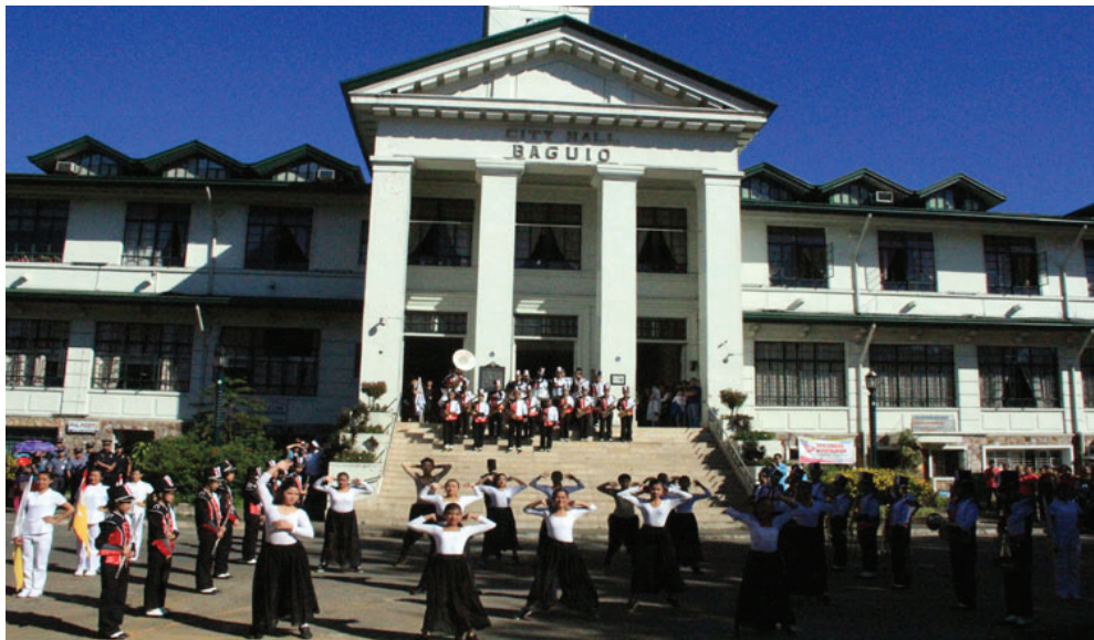
BAGUIO DAY LAUNCHING – Members of the Baguio City National High School Special Performing Arts present an interpretative dance for the launching of the 106th Baguio Day Anniversary during City Hall flag raising ceremony, August 17.