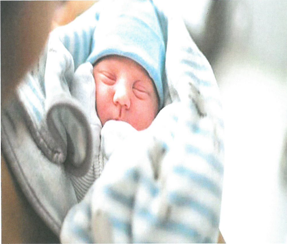
Series: The Seasons; Christmas Day; 25th December

There are so many truths to ponder about the birth of Christ, so let's start with just one. Who exactly does Mary hold in her arms in Bethlehem? The manner in which we answer this is what makes us Christian; it is what shapes the way we live our lives.