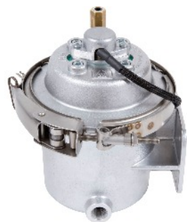
Smaller EDI 150 unit

Hydraulic systems, gearbox, stern tubes, thrusters etc., connected directly to the system whilst the machinery is operating ensures water and contaminants are treated immediately. Alternatively available as a stand alone unit with integral heater and pump for 24/7 off line cleaning.