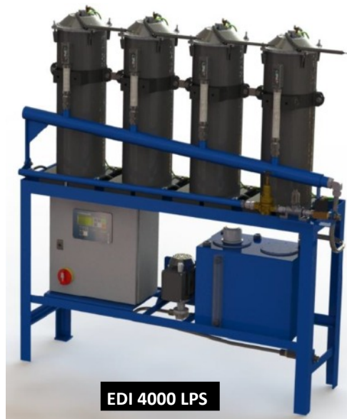
EDI 4000 LPS