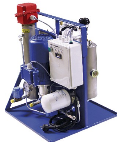
EDI 800 - Self-contained mobile unit