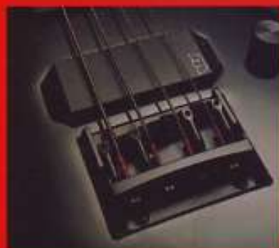
Magnacast Die cast Bass Bridge