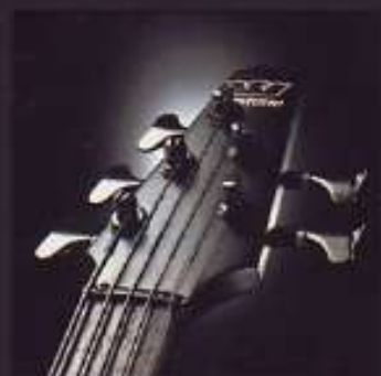
5 String Headstock on X775PW Bass