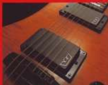
Magnaflex OFC pickups