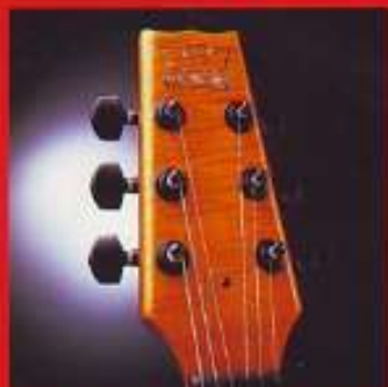
Inlaid maple truss rod cover