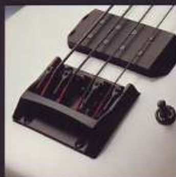
Magna Cast Bridge on X750