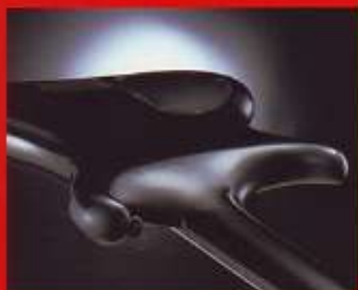
Arched, bayonet back for comfort