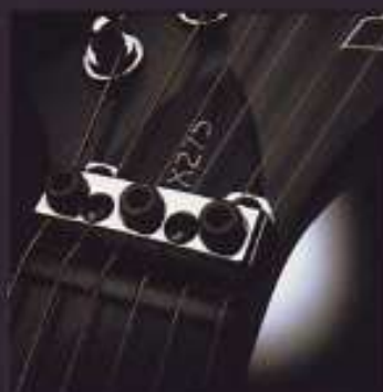
X275CS Westone string lock to insure stay in tune performance