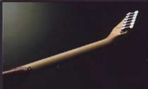
X275CS/VI Oil finished neck for playing ease.