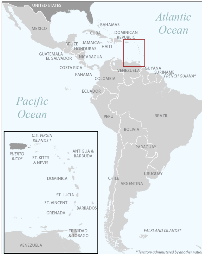
Figure 1. Map of Latin America and the Caribbean