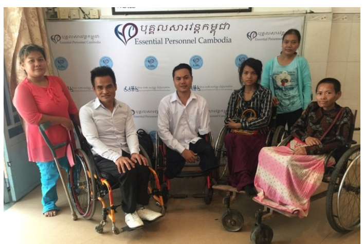
our job seekers