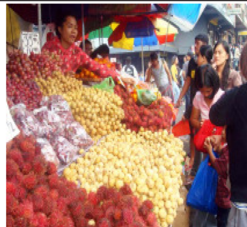
SIGNS OF THE COMING YULETIDE SEASON - Local and imported fruits begin to flood the city market to signal the start of the Christmas celebration.