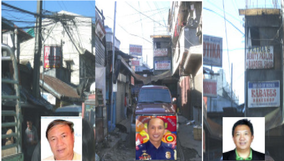
Hon. Nestor Fongwan Benguet Governor