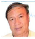
Hon. Nestor Fongwan Benguet Governor