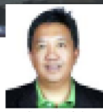
Hon. Gregorio Abalos Jr. La Trinidad Mayor