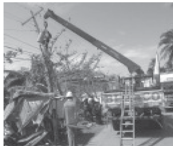
WORK MISSION - Beneco linesmen who volunteered for Capiz restore electricity by the seashore, the plains and foothills of the province reeling from the devastation wreaked by typhoon Yolanda

The vendors however failed to mention that Mayor Domogan earlier requested that alternative goods, or Christmas toys and other wares be considered in lieu of selling pyrotechnics. He has also asked that Paputok, Lucis atbp vendors join the bidding for the city-sponsored centralized air shows scheduled during the