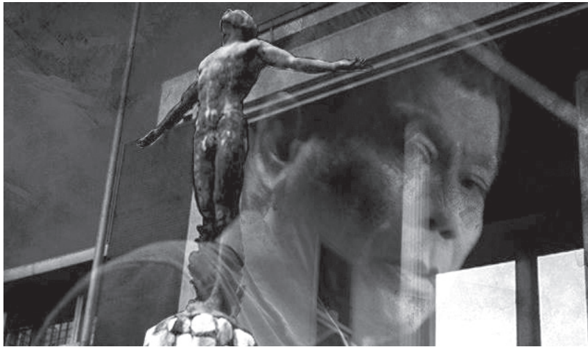
UP file photo from Wikimedia Commons; Duterte file photo by Alecs Ongcal/Rappler

"At the minimum, that should be the role of UP: promote the free discussion of issues, to ventilate the issues confronting the country, because that's important," he said. / Rappler.com#