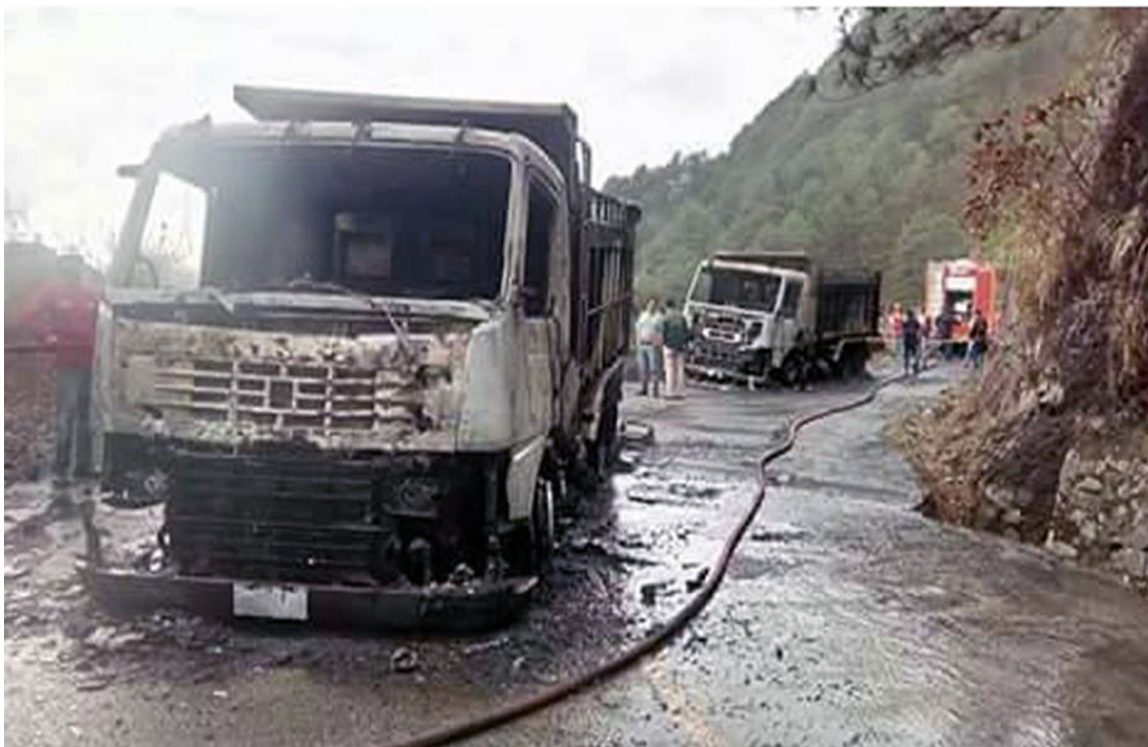
Firefighters douse off the burning trucks of Philex Mining Corp along Ampucao as they exert all effort to stop the fire from spreading and creating forest fire in the area. It was reported that the NPAs are responsible for the incident.

Aysus! Gamitin kasi ang utak. Hindi porke't may picture si Meyor ay papatulan niyo na! Si Meyor, 'papapicture' yan kahit kanino. Magtrabaho kayo, wag mag-papaniwala sa malaking kita habang nakupo lang!