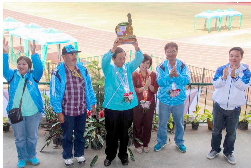
PERENNIAL CHAMPION - Baguio City local and school officials headed by Mayor Mauricio Domogan proudly show off the Over-All CARAA Championship trophy during the just-concluded CARAA games February 8 at the Baguio Athletic Bowl. Powerhouse Baguio City won again by a landslide victory with 232 golds, 112 silvers and 59 bronze medals. The Palarong Pambansa 2017 will be held tentatively in Antique on April 10 to 16, 2017.

na ang pagdadialysis ay isang magastos na proseso. Paano na lang po ang mga mahihirap na may ganitong karam-daman?" Michelle asked.