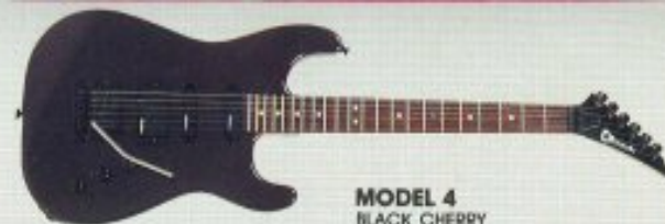
MODEL 4 BLACK CHERRY

FINGERBOARD W/BOLT ON NECK, SOLID BASSWOOD BODY. FINISH OPTIONS: BLACK, RED, PEARL WHITE