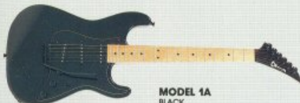
MODEL 1A BLACK

KNOB, THREE 2-WAY MINI-TOGGLE SWITCHES, ROSEWOOD FINGERBOARD W/BOLT-ON NECK, SOLID BASSWOOD BODY. FINISH OPTIONS: BLACK, RED, PEARL WHITE, COBALT BLUE, BLACK CHERRY