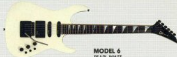
MODEL 6 PEARL WHITE

FINGERBOARD W/BOLT-ON NECK, SOLID BASSWOOD BODY. FINISH OPTIONS: BLACK, RED, PEARL WHITE