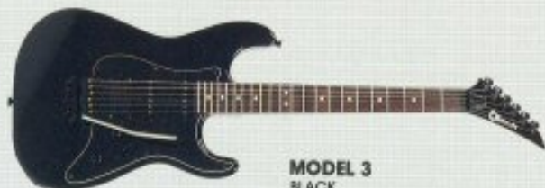
MODEL 3 BLACK

SWITCH, MAPLE FINGERBOARD W/BOLT-ON NECK, SOLID BASSWOOD BODY. FINISH OPTIONS: BLACK, RED