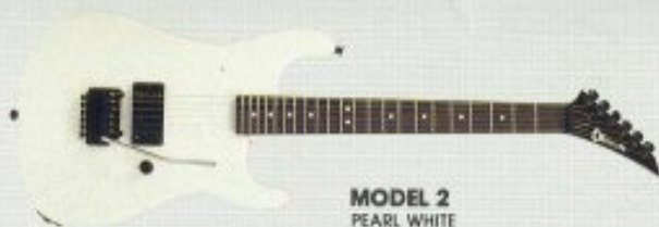
MODEL 2 PEARL WHITE

FINGERBOARD W/BOLT ON NECK, SOLID BASSWOOD BODY. FINISH OPTIONS: BLACK, RED