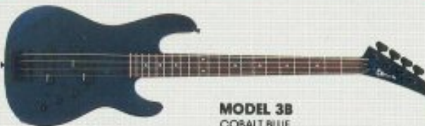
MODEL 3B COBALT BLUE

CONTROL, ROSEWOOD FINGERBOARD W/BOLT-ON NECK, SOLID POPLAR BODY. FINISH OPTIONS: BLACK, RED, PEARL WHITE