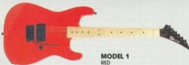
MODEL 1 RED

FEATURES ... ONE J-90C HUMBUCKING PICKUP, TRADITIONAL 3-SPRING FULCRUM TREMOLO, ONE VOLUME CONTROL, MAPLE