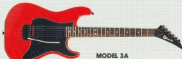
MODEL 3A RED

SWITCH, MAPLE FINGERBOARD W/BOLT-ON NECK, SOLID POPLAR BODY. FINISH OPTIONS: BLACK, RED