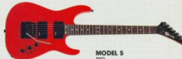
MODEL 5 RED

TOGGLE SWITCH, ROSEWOOD FINGERBOARD W/BOLT-ON NECK, SOLID BASSWOOD BODY. FINISH OPTIONS: BLACK, RED, PEARL WHITE