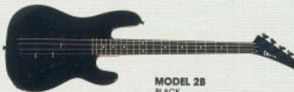
MODEL 2B BLACK

FEATURES ... ONE J-20 SPLIT COIL PICKUP AND ONE J-150 SINGLE COIL PICKUP, MASTER VOLUME, PICKUP BALANCE CONTROL WITH CENTER DETENT, ONE TONE