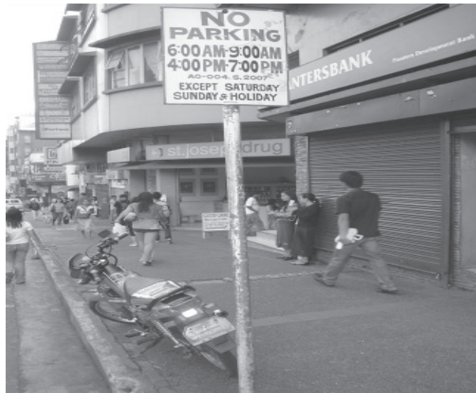
IT USED TO BE FOR WALKING. Now, the sidewalks along Session Rd. are even used for parking by nonchalant bikers. Wonder where the cops have gone... /Bong cayabyab