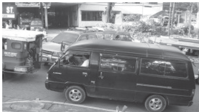
TRAFFIC PROBLEM - Two hard headed drivers traversing from Upper Kayang Extension use the access road at the back of city hall as "short cut" causing heavy traffic situation along Naguillan Road.