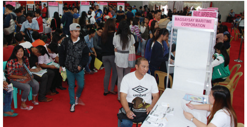
BAGUIO DAY JOB FAIR - More than 3,200 job seekers applied for local and overseas employment during a Job fair at the Baguio Convention Center. A total of 388 applicants were hired on the spot for local employment while six males and seven females were hired on the spot for overseas employment during the job fair.

The participants were also taught how to craft their own Public