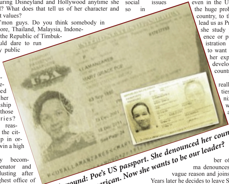
Background: Poe's US passport. She denounced her country to try to be an American. Now she wants to be our leader?