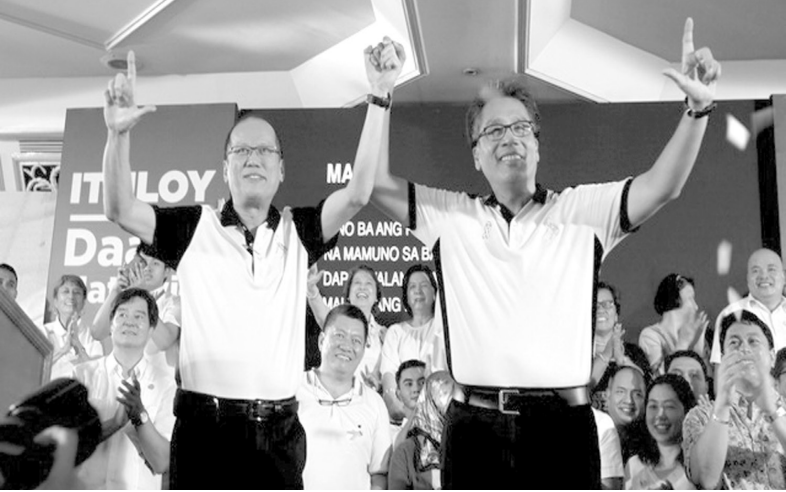
DAANG MATUWID. President Benigno S. Aquino III formally endorses Interior and Local Government Secretary Manuel Roxas II as the standard-bearer of the ruling Liberal Party (LP) in 2016.

help validate the effectiveness of the programs being implemented by the local government. A job fair will be mounted by the PESO on Sept. 9 at the Baguio Convention Center. A literary competition will again be conducted to be participated in by the schools. The Baguio Day program will be highlighted still by the awarding of the outstanding citizens and sports achievers./A Refuerzo