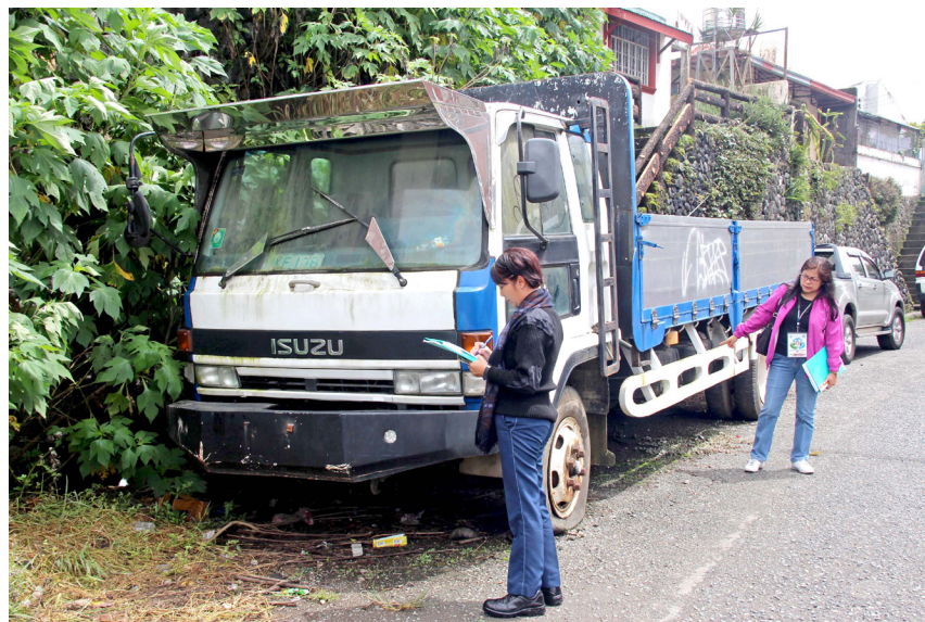
ABANDONED VEHICLE ALONG THE STREETS - Members of the Alay Sa Kalinisan Search for the 10 Cleanest and 10 Dirtiest barangays take note of the abandoned truck along the street in violation of City Ordinance Number 55-58 otherwise known as Comprehensive Traffic and Transportation Ordinance for appropriate action and impose the necessary penalties by the proper authorities. /By Bong Cayabyab

Mayor Mauricio Domogan, Ngolob and Eclar met earlier with representatives of local universities and colleges to confirm their commitments in allowing their facilities and equipment to be used if ever Baguio and Benguet are chosen as hosts of the country's largest sports event. It