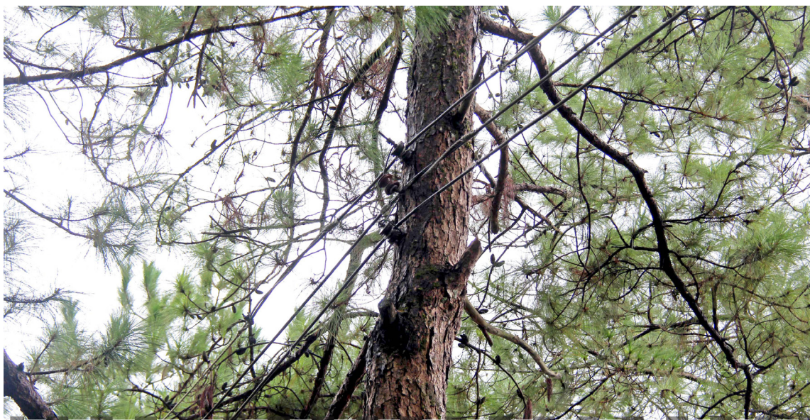
POOR TREE - The unlawful nailing and bolting of BENECO electric service wires on a living pine tree within the vicinity of a barangay hall is a clear violation of City Ordinance Number 6. Any person violating this ordinance shall be penalized with a fine of P5,000 or 30 days of imprisonment or both upon the discretion of the court./ By Bong Cayabyab.

Fr. Flores denounced the city council's disregard of the people's earlier appeal for the city to stop the operation of the existing bingo joints and to disapprove new applications and threatened to initiate a signature campaign or people's initiative to Cont. on page 5