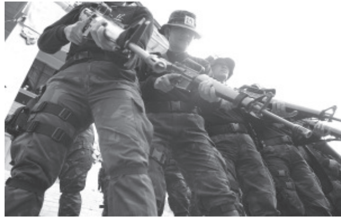
BAGUIO CITY -- A 20-member all female SWAT policemen here simulate their readiness and inoperability during urban violence and other precarious "situations" after continuous rigorous training here including Close Quarter Battle, Firing Proficiency, and High Altitude Rope Battle. The first all female SWAT team in Baguio and among several all female SWAT teams in various highly-urbanized cities in the country, the female policemen only know by their numbers like their male counterparts display confidence in various dangers they have to face in urban warfare scenarios. --stringer./ Ace Alegre

The city offered several lots but were rejected by the NPC as these were not suitable as site of the NPC regional office./Aileen P. Refuerzo