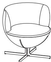
Four-Star Base (***) - HS 437mm Size: W728xD707xH716mm W28" 3 / 4 xD27" 7 / 8 xH28" 1 / 8 xHS 17" 1 / 4