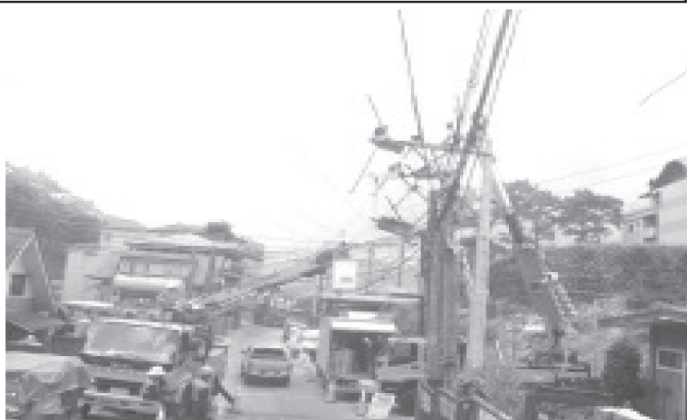
HIGH WIRE ACT - BENEKO linesmen repair electrical wire connections and replace old electric posts in Pinget barangay for upgrading and maintenance in preparation of the rainy season.