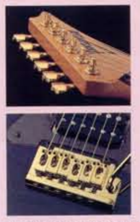
*The SV470 and R355GF guitars feature Ibanez TZ-6 tremolo and Magnum locking tuner for excellent tuning stability and full tone.