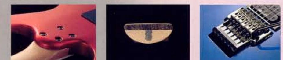
*Ibanez All Access Neck Joint is featured on the S540, S470, SV470 and SF470 models. *S540 series features our popular super thin Wizard neck. *Ibanez Lo-Pro Edge Tremolo System (Licensed Under Floyd Rose Patents)

Ibanez designed the "S" body guitar to answer players' requests for a guitar that would combine a super thin mahogany body, ultra sleek good looks, versatility and power. The S540 and S470 guitars are equipped with the streamlined Lo-Pro Edge Tremolo system which allows both heavy tremolo playing and traditional right hand picking.