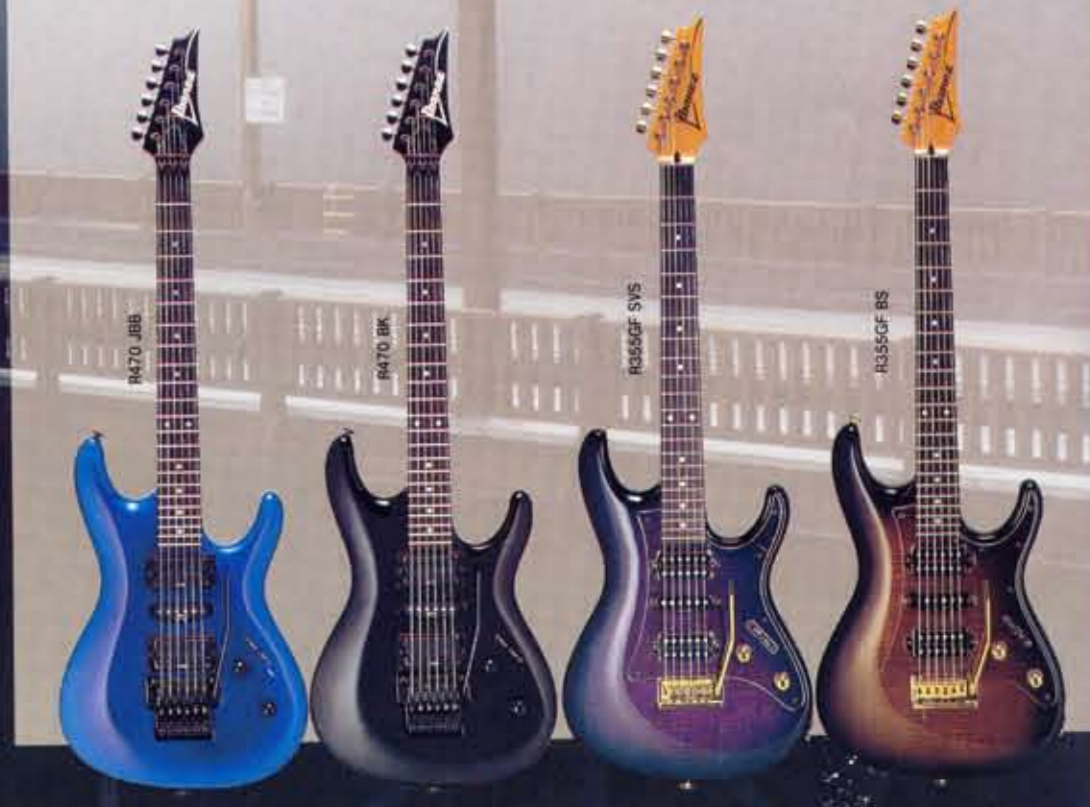
*The R355GF guitar features the new Gravure Flame Top finish on a newly designed alder body.