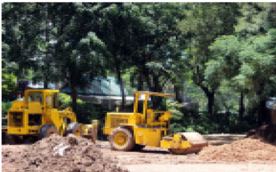
BRIDLE PATH REHABILITATION - The repair and rehabilitation at Bridle Path is being undertaken in preparation for the influx of tourists in the coming months. - By Bong Cayabyab

On Sept. 30, Monday, a closing program with awarding of scrapbook contest winners, and launching of the Search for Huwarang Pamilya and Family Got Talent contest in coordination with the Department of Interior and Local Government (DILG) shall be done at city hall grounds./ juliegfianza