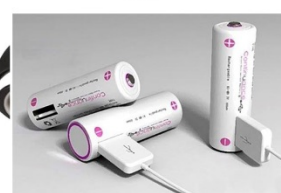
USB Battery cells