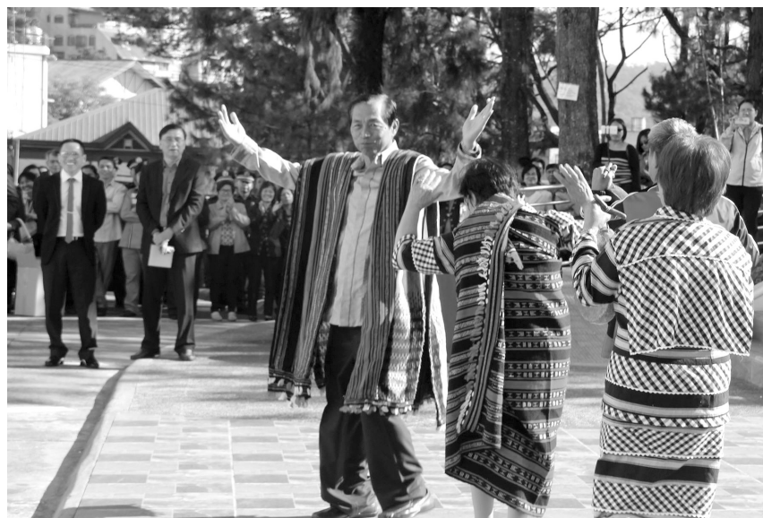
A MIXTURE OF CULTURE, ARTS AND TRADITION - Mayor Mauricio Domogan leads the "tayaw" during the launching of Chinese Lunar New marking the Year of the Red Rooster held at City Hall grounds last January 9.