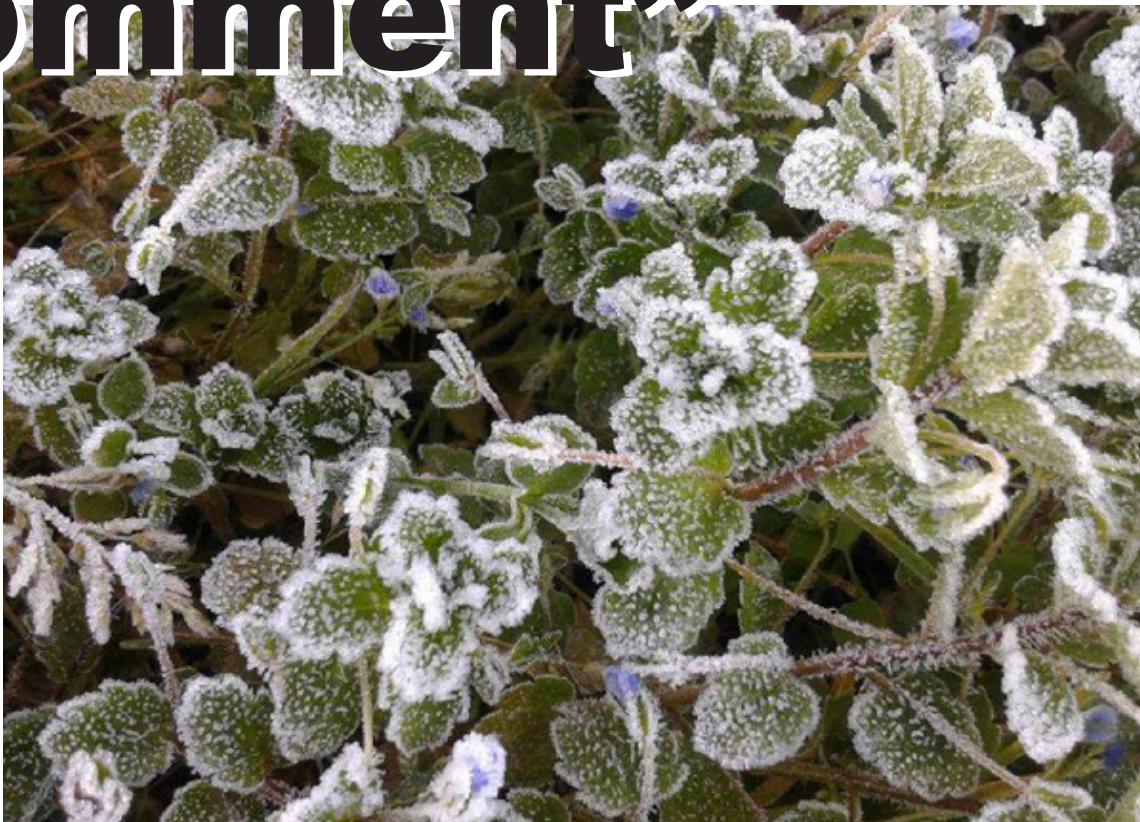
THE FROST - Some vegetable-producing parts of Kibungan in Benguet experienced frost this week that affected their garden. While the frost had little effect on the province's entire vegetable output, some poor farmers are severely affected. This is by far the coldest we've had in 3 decades, PAGASA said.