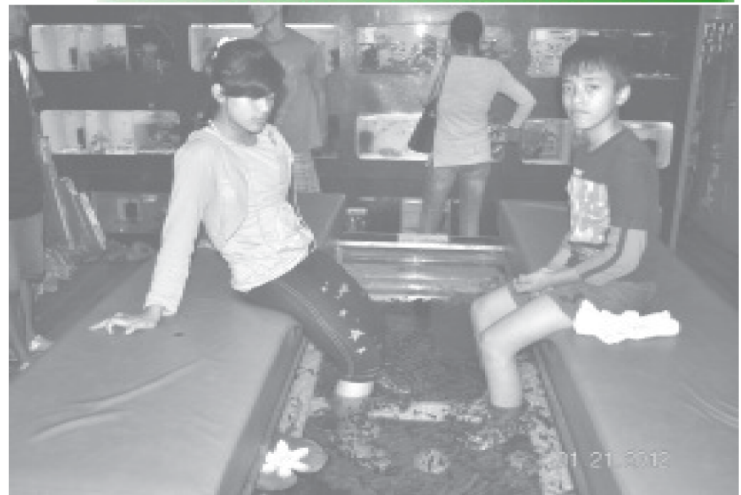
FISH FOOT SPA - Two children enjoy the tickling sensation while experiencing a "fish foot spa" from local pet shop here.