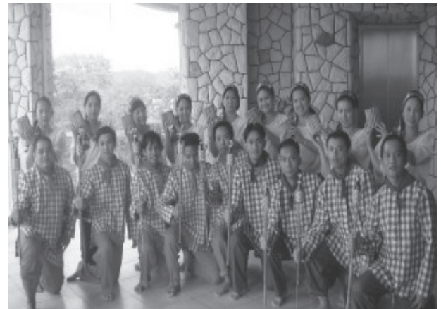
HINDI LANG PANG OPISINA... The City Hall Dance Company prepares for a performance during the 108 th Anniversary of the Philippine Civil Service held last Sept. 30 at the Pines View Hotel. The group, together with the City Hall Choir and Cultural Dance Troupe has been recently institutionalized via a City Council resolution.

locality where its services can be readily accessed.