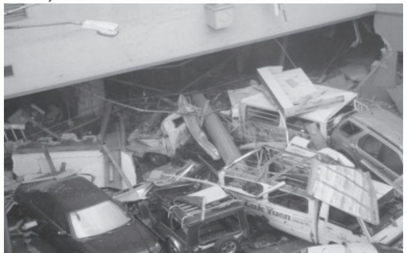
Crime scene from the Glorietta bomb blast in Makati City which killed 8 and injured 120 people midnight of Oct. 19.