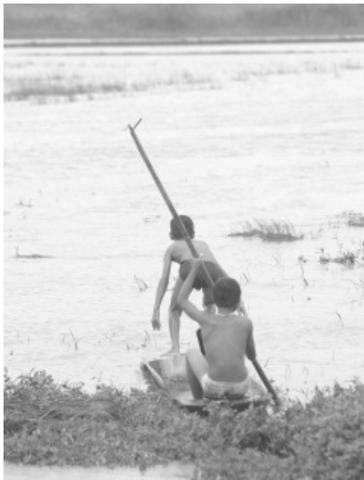
Gonzaga, Cagayan -- Young boys aboard a small wooden banca play at a swamp here filled with ain water as a low pressure area affecting Northern Luzon has intensified rains. -- Artemio A. Dumlaog