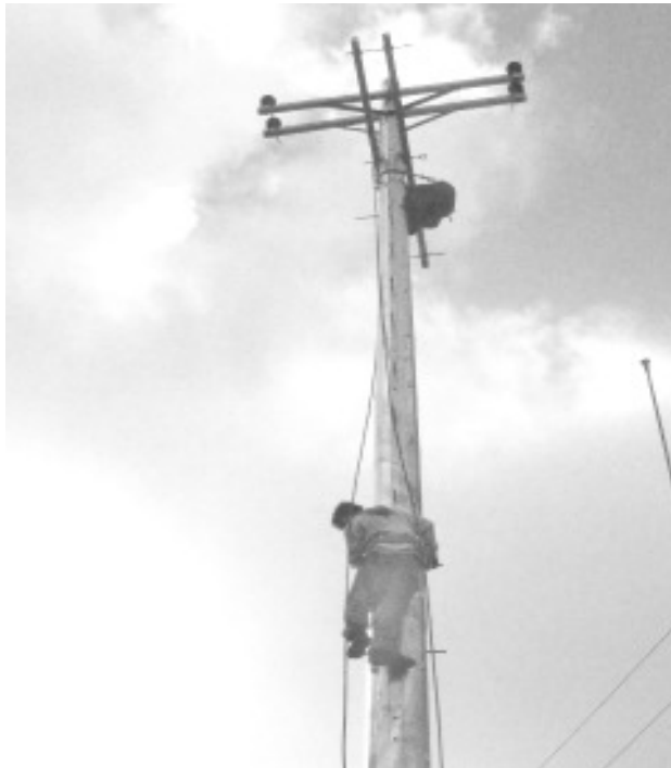
UMMM... HOW DO I GO DOWN AGAIN? A lineman from the Baguio-Benguet Electric Cooperative carefully makes his way up in one of the newly-installed poles along Abanao as part of "operation spaghetti" which goal is to stretch 'em loose noodles of wires before the February 1 launching parade of Panagbenga 2008.

BAGUIO CITY - It is classically, a win some and lose some scenario with the Philippine peso gaining good showing.