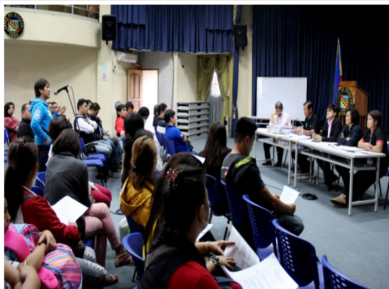
"NIGHT MARKET CONCERNS" – City Mayor Mauricio Domogan and members of the Baguio City Market Authority (BCMA) meets with night market vendors to address issues and concerns for a better and orderly night market especially during the influx of tourists.