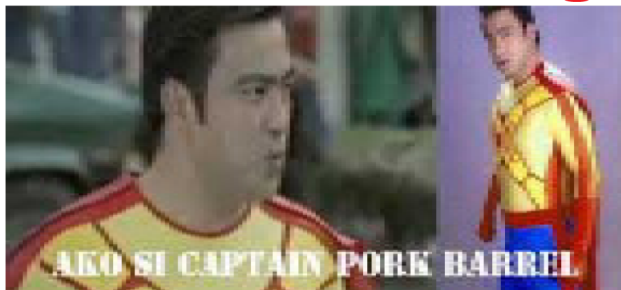
Strike 1, 2 more to go!!!

Woman to be First Charged Under Philippine Cybercrime Law...p2