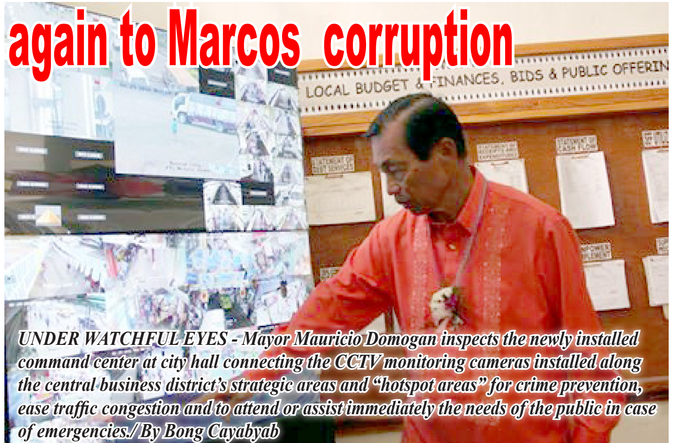
UNDER WATCHFUL EYES - Mayor Mauricio Domogan inspects the newly installed command center at city hall connecting the CCTV monitoring cameras installed along the central business district's strategic areas and "hotspot areas" for crime prevention, ease traffic congestion and to attend or assist immediately the needs of the public in case of emergencies.

Dapat lang na tanggalin na yan mga bank secrecy laws pag dating sa mga bank account(s) ng mga government officials!!!