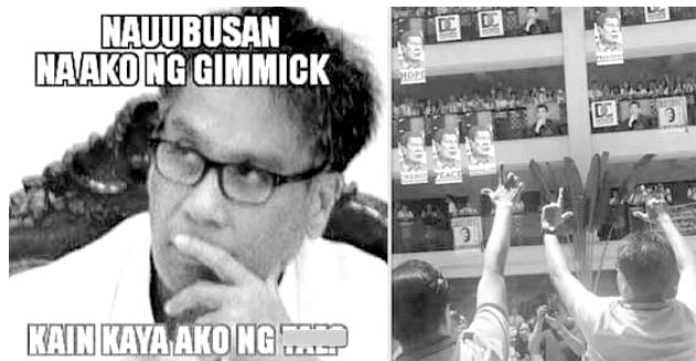
Two of the funny Facebook memes vs Roxas.

Whatever the recent presidential-preference surveys say, the President's bet, and the declared candidate of the ruling Liberal Party, Manuel Roxas 2nd, is really out of the race – roughly the current version of the 1992 ruling-party bet Ramon Mitra in that year's elections.