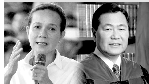
DISSENT. Supreme Court Justice Antonio Carpio says to allow a presidential candidate who was deemed not natural born Filipino by the Commission on Elections is a 'mockery' of the polls.

"To allow a person, who is found by the Comelec not to be a natural-born Filipino citizen, to run for President of the Philippines constitutes a mockery of the election process," says the senior associate justice.