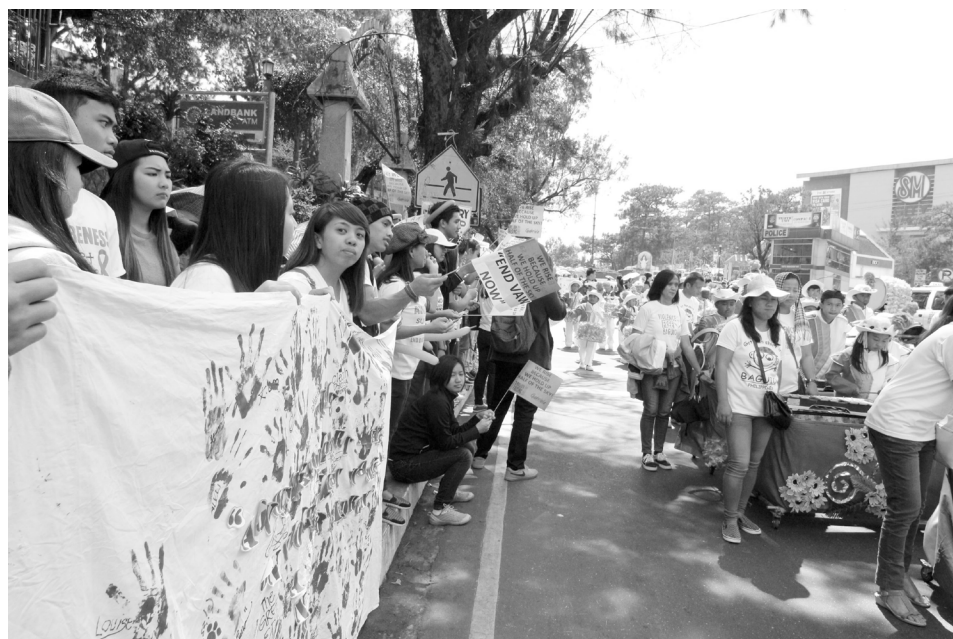
STOP VAW ! - Placard bearing supporters of the rights of women call for the stoppage of violence against women while watching the parade at Session Road during the observance of International Women's Day.

As of April 2015, the BFP reported that there are a total of 18,769 registered firefighters in the country.