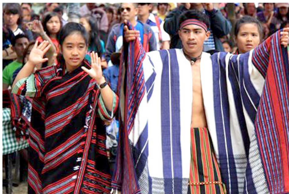
KEEPING UP THE TRADITION AND CULTURE - Members of Ibaloi younger generation perform dances and rituals during the Ibaloi Festival observance to preserve the rich cultural heritage of the tribe./By Bong Cayabyab