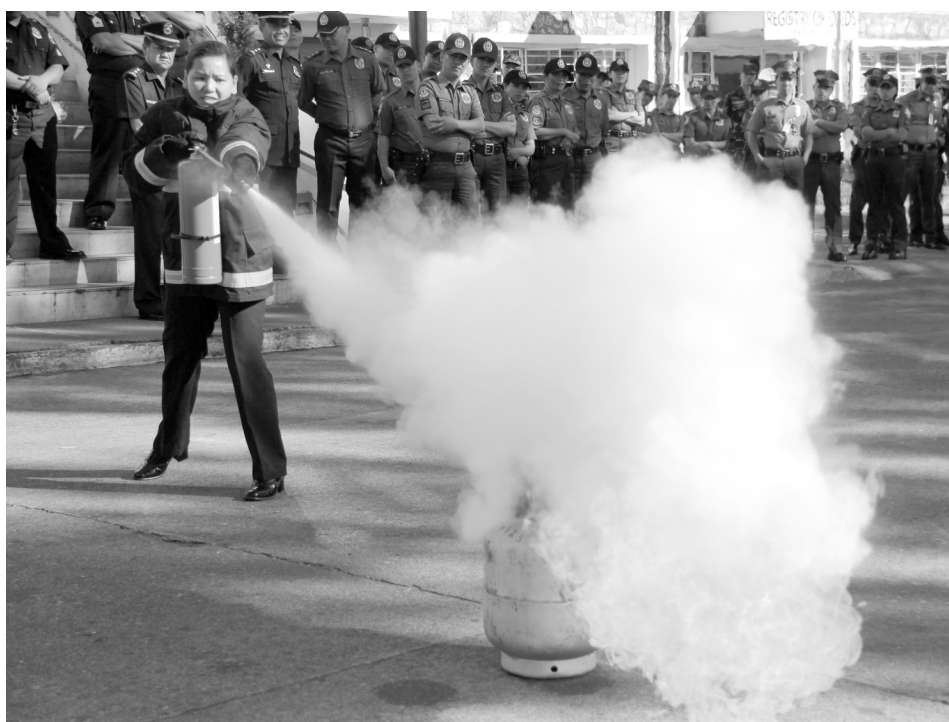
FIRE PREVENTION —Members of the Baguio's Bravest (Fire Department) demonstrate how to contain a burning LPG tank and prevent the fire from spreading during the observance of Fire Prevention Month held at City Hall grounds after the flag raising ceremony.