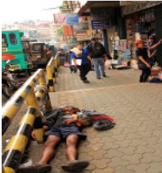
A LOONY sleeps along a pedestrian lane at the city market obstructing the market goers. Offices concerned are wondering how loonies from nearby provinces were able to come up to the city./By Bong Cayabyab

EARN $60 A DAY (OR P65K A MONTH) WORKING AT HOME!