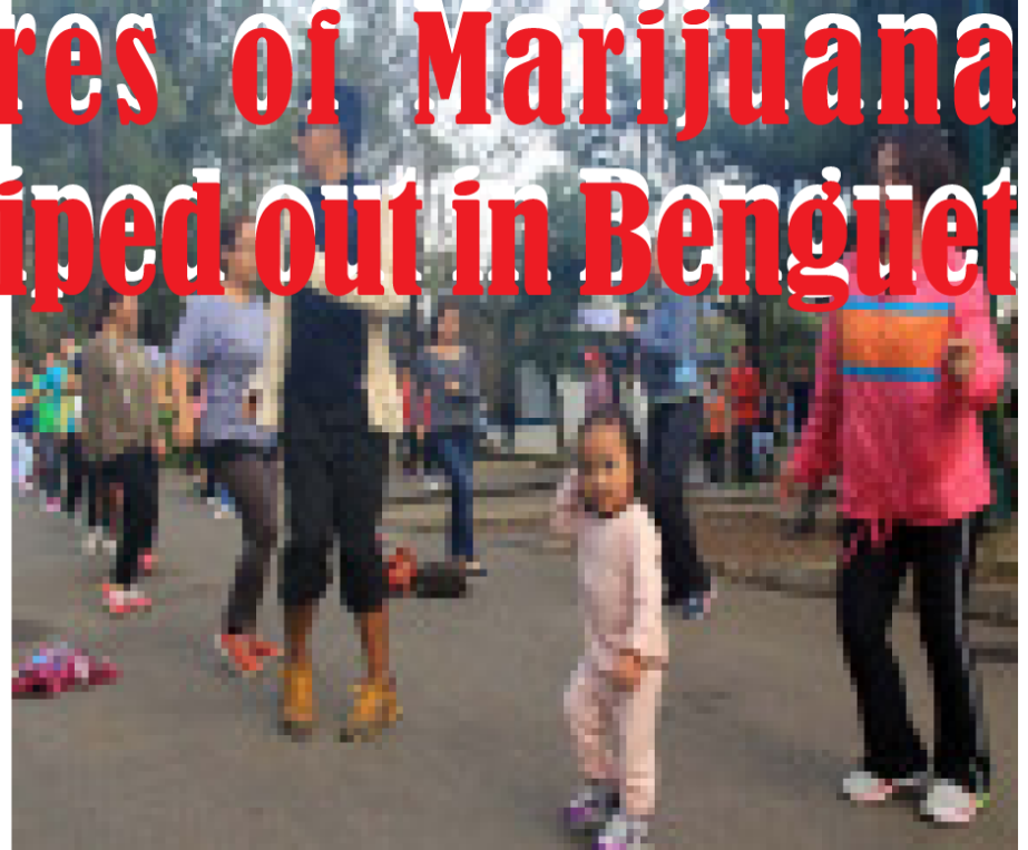
YOUNG HEALTH BUFF – A child joins her mother and other health conscious Baguio residents during an early morning Zumba workout at Burnham Park.