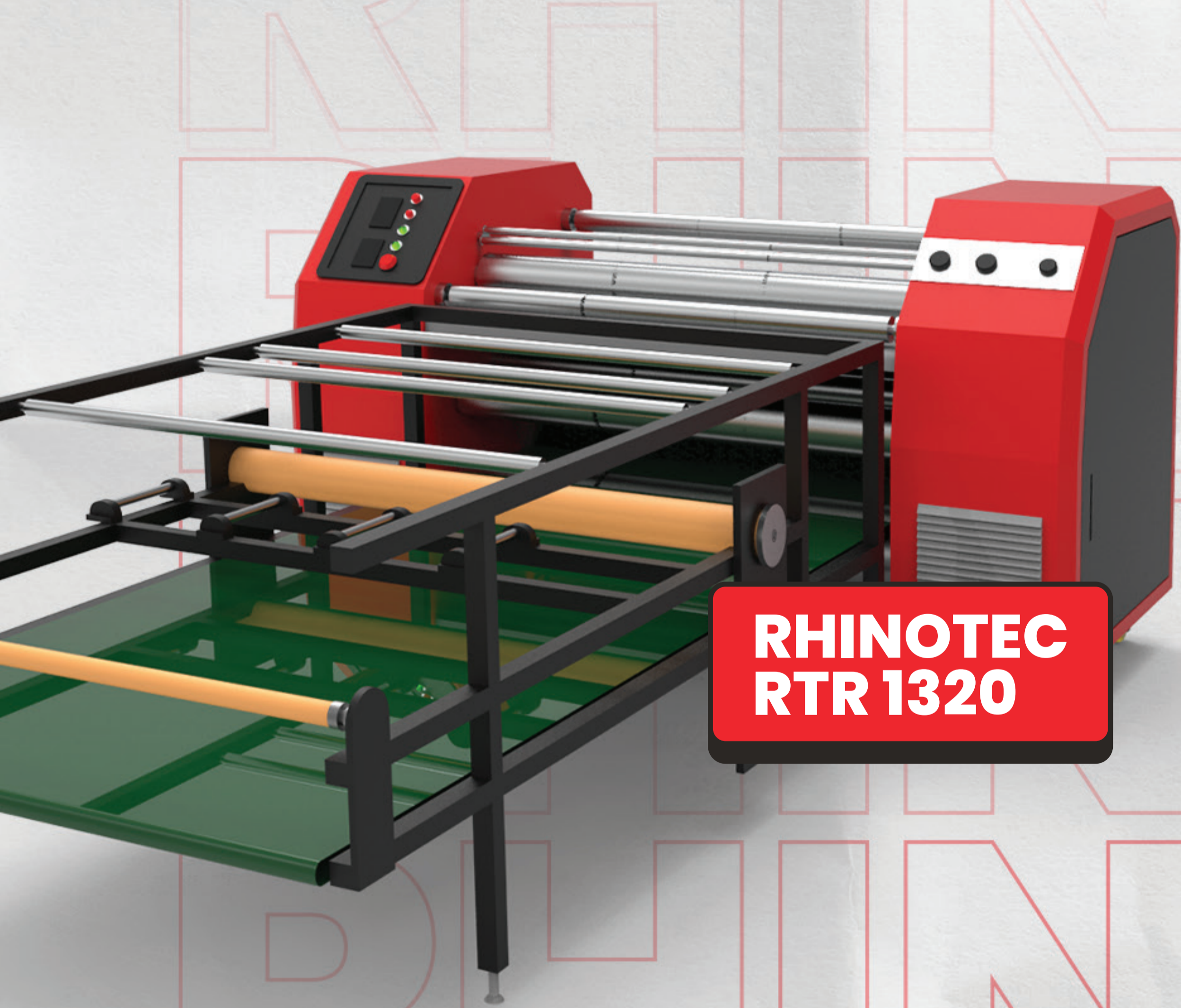
RHINOTEC RTR 1320