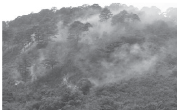
Mountain fire - Thick smoke hovers as fire burns portion of this mountain in Bontoc, Mountain Province. Forest fire is now a common scene in this mountainous province thus local officials are asking the public to help prevent fires to save the remaining forests.